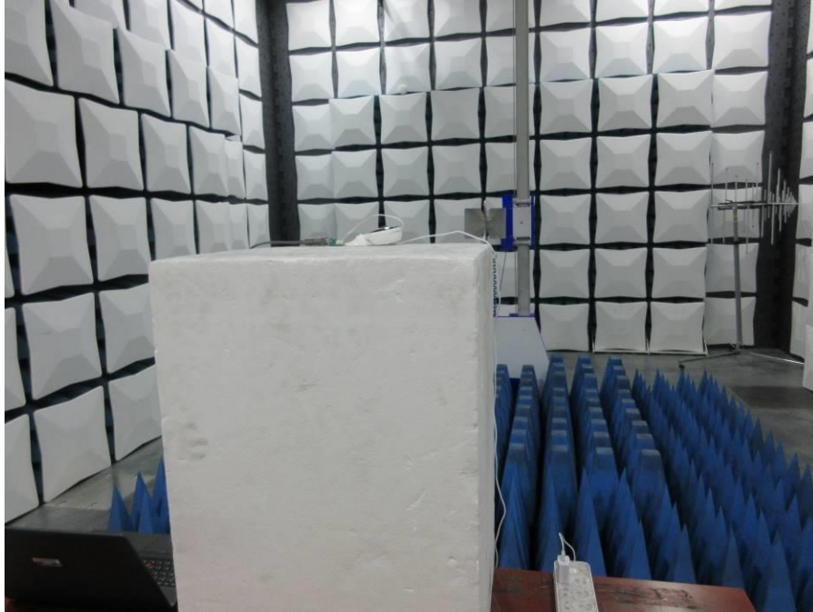
RADIATED RF MEASUREMENT SETUP (ABOVE 1 GHz- Y axis)