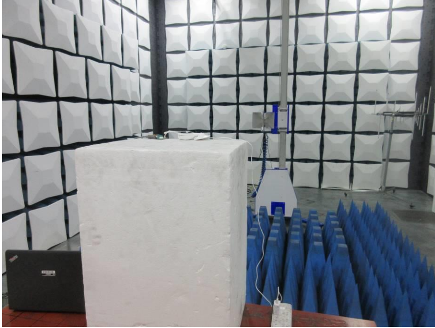
RADIATED RF MEASUREMENT SETUP (ABOVE 1 GHz- Y axis)