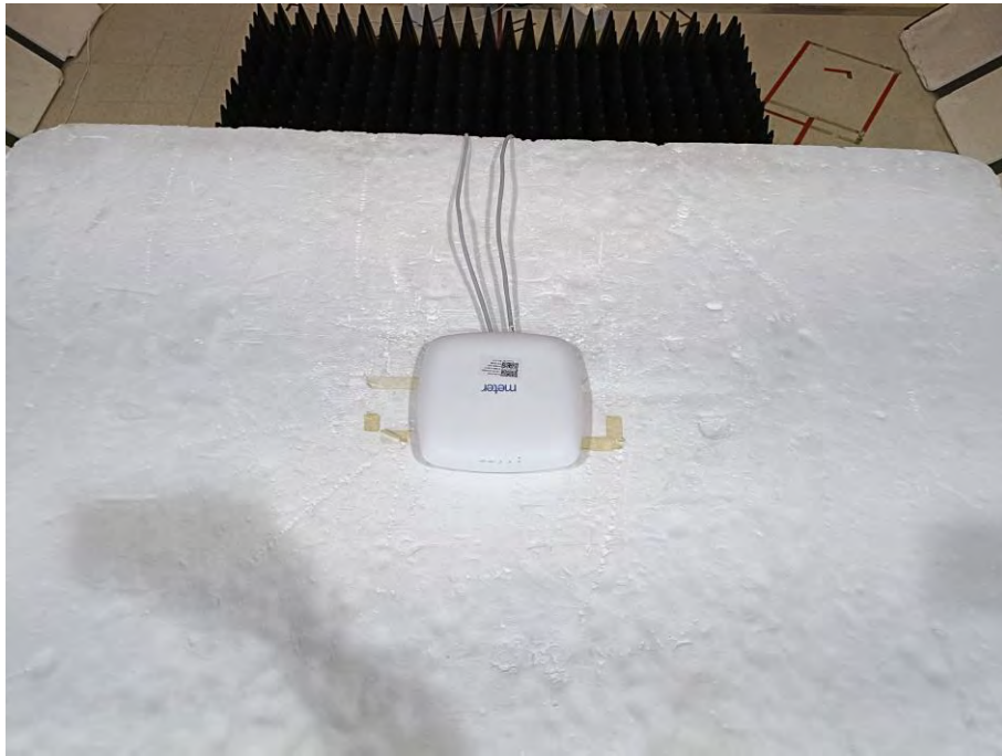
Above 1 GHz _ Rear View