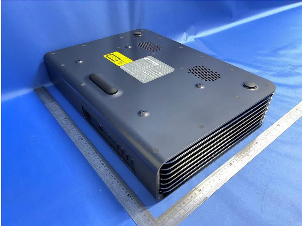
OUTSIDE VIEW-3 OF EUT