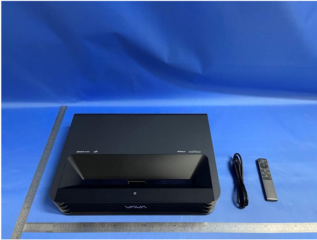
OUTSIDE VIEW-1 OF EUT