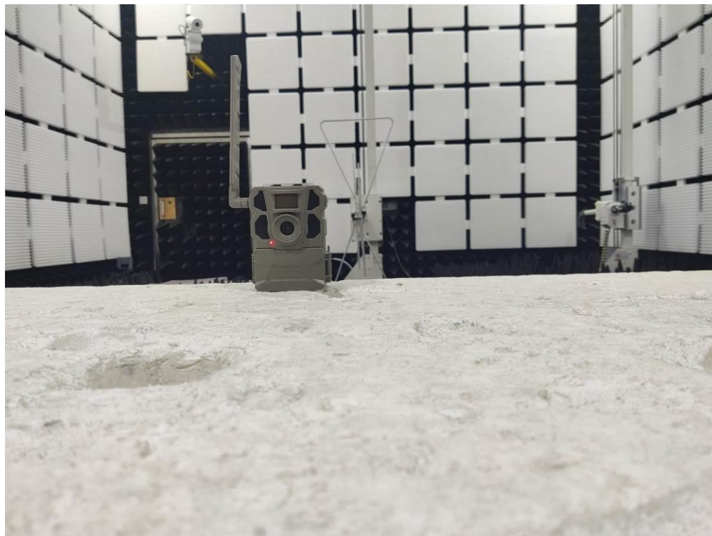
Below 1 GHz