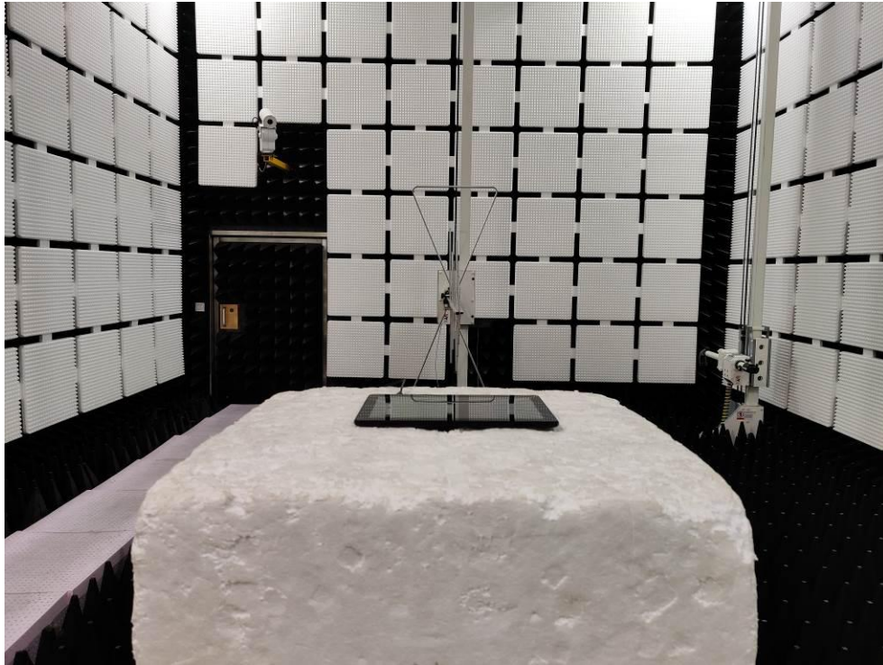
Fig. 1 (Below 1GHz)