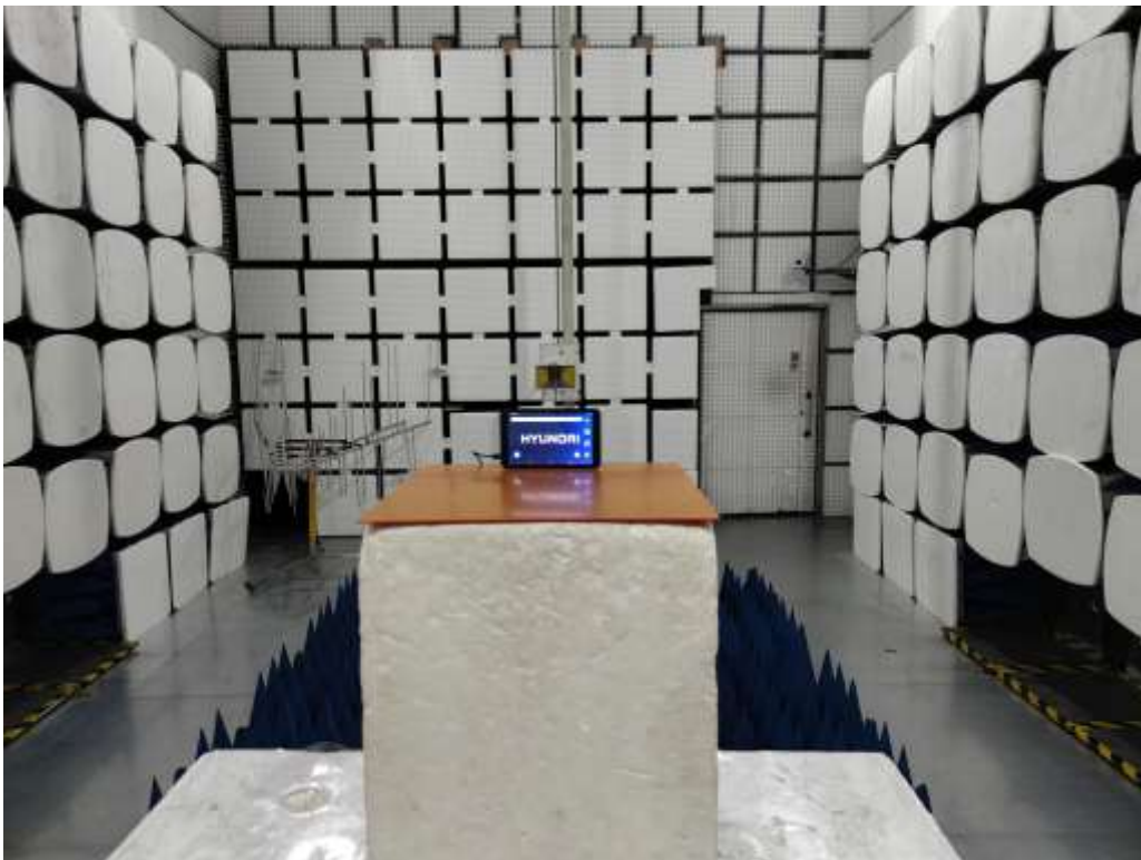
Fig. 2 (Above 1GHz)