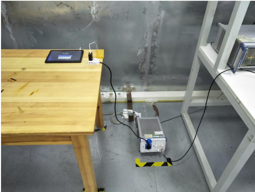
AC Conducted Emission of charge from power adapter mode