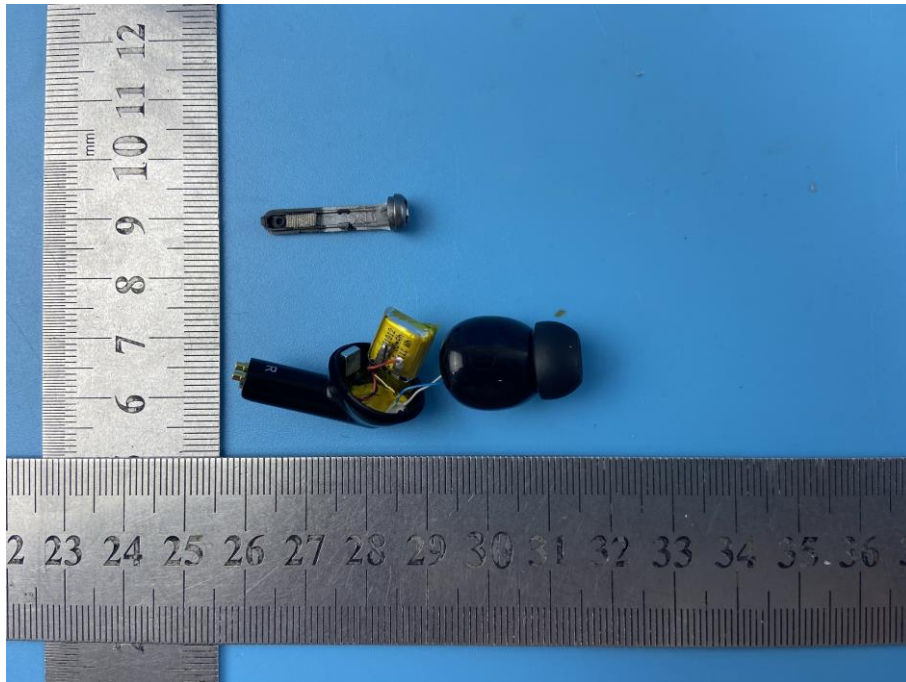
INTERNAL PHOTO OF SAMPLE PCB