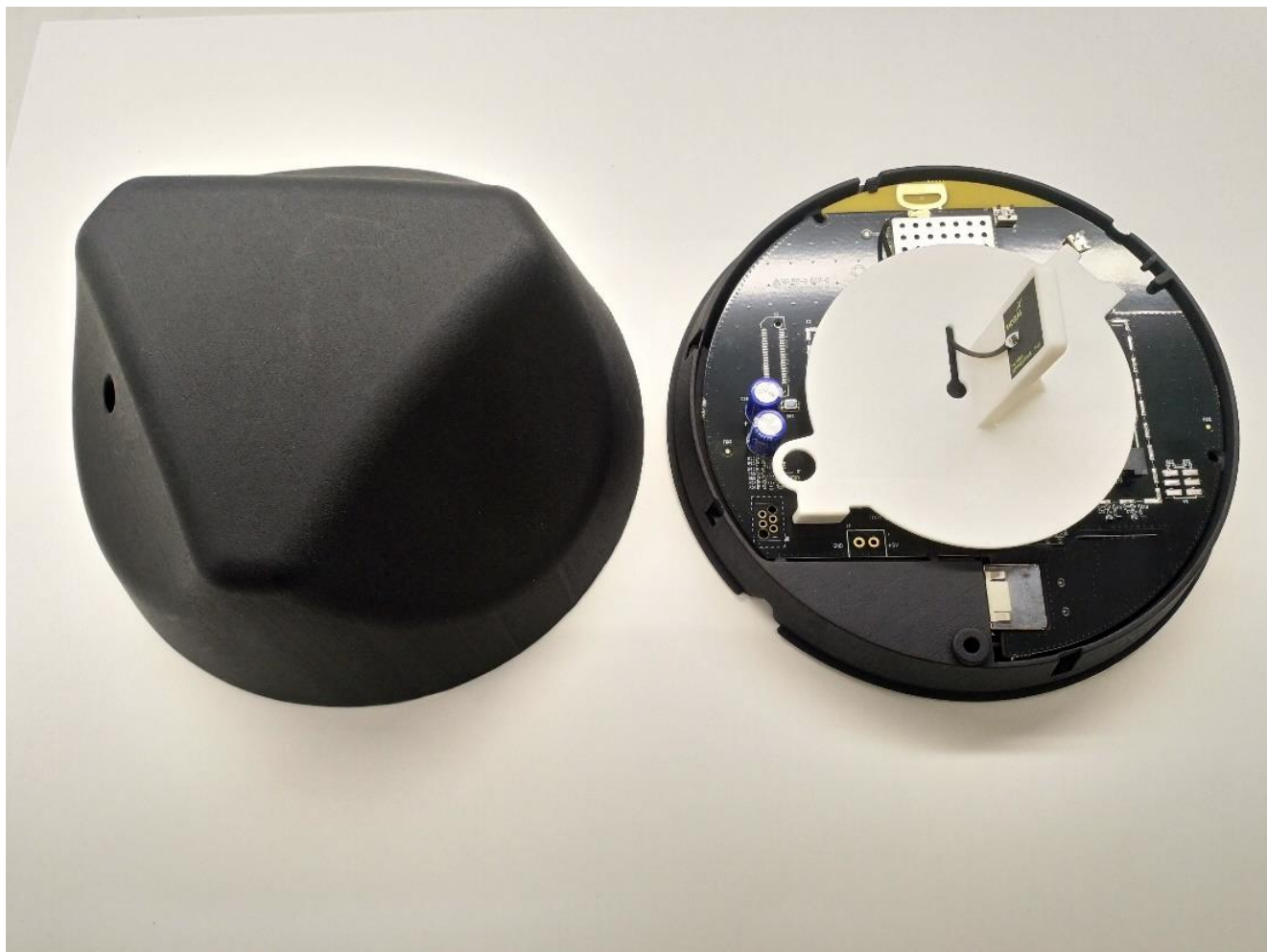
Beacon Internal photograph