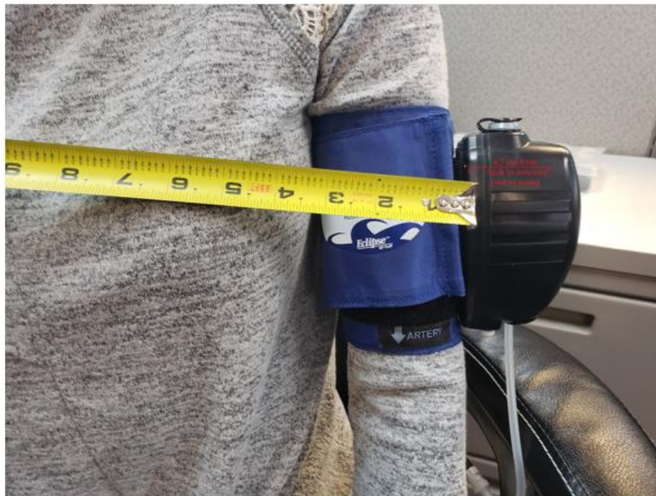
Figure 1. Photograph showing proximity of WVSM to the user.