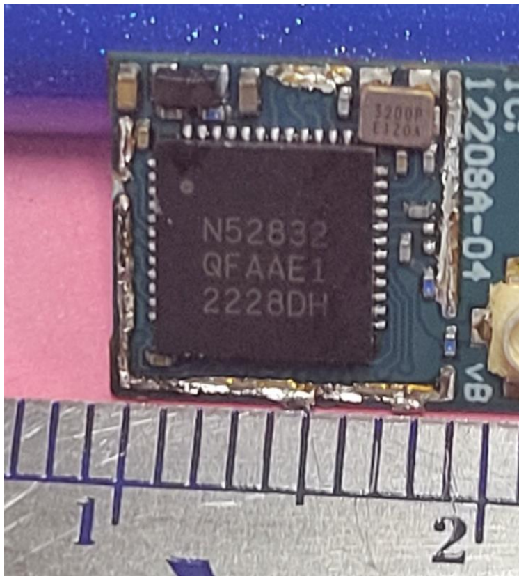
Close up/Marking View of Chip and Oscillator (Scale in mm)