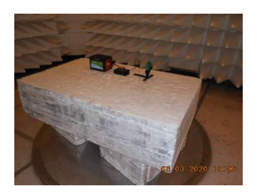
Below 1GHz with Antenna Port Filled