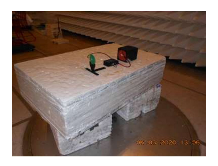
Below 1GHz with Antenna Port Filled