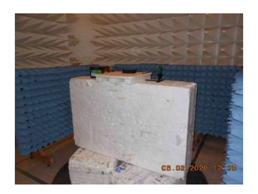
Above 1GHz with Antenna Port Filled