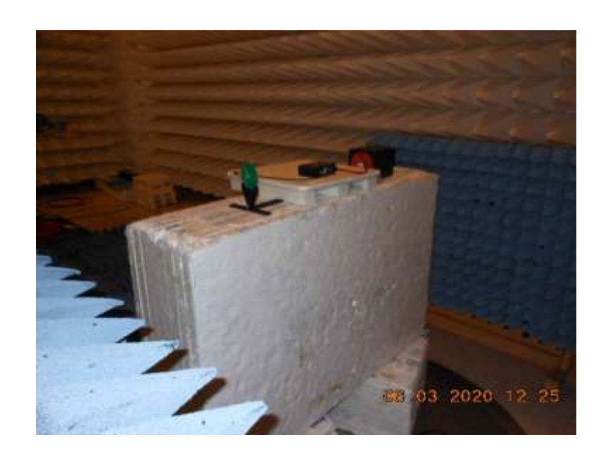
Above 1GHz with Antenna Port Filled