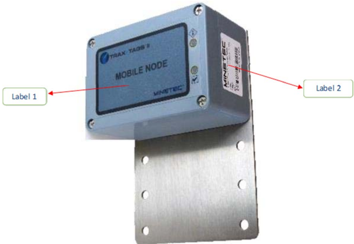
Front View of Mobile Node