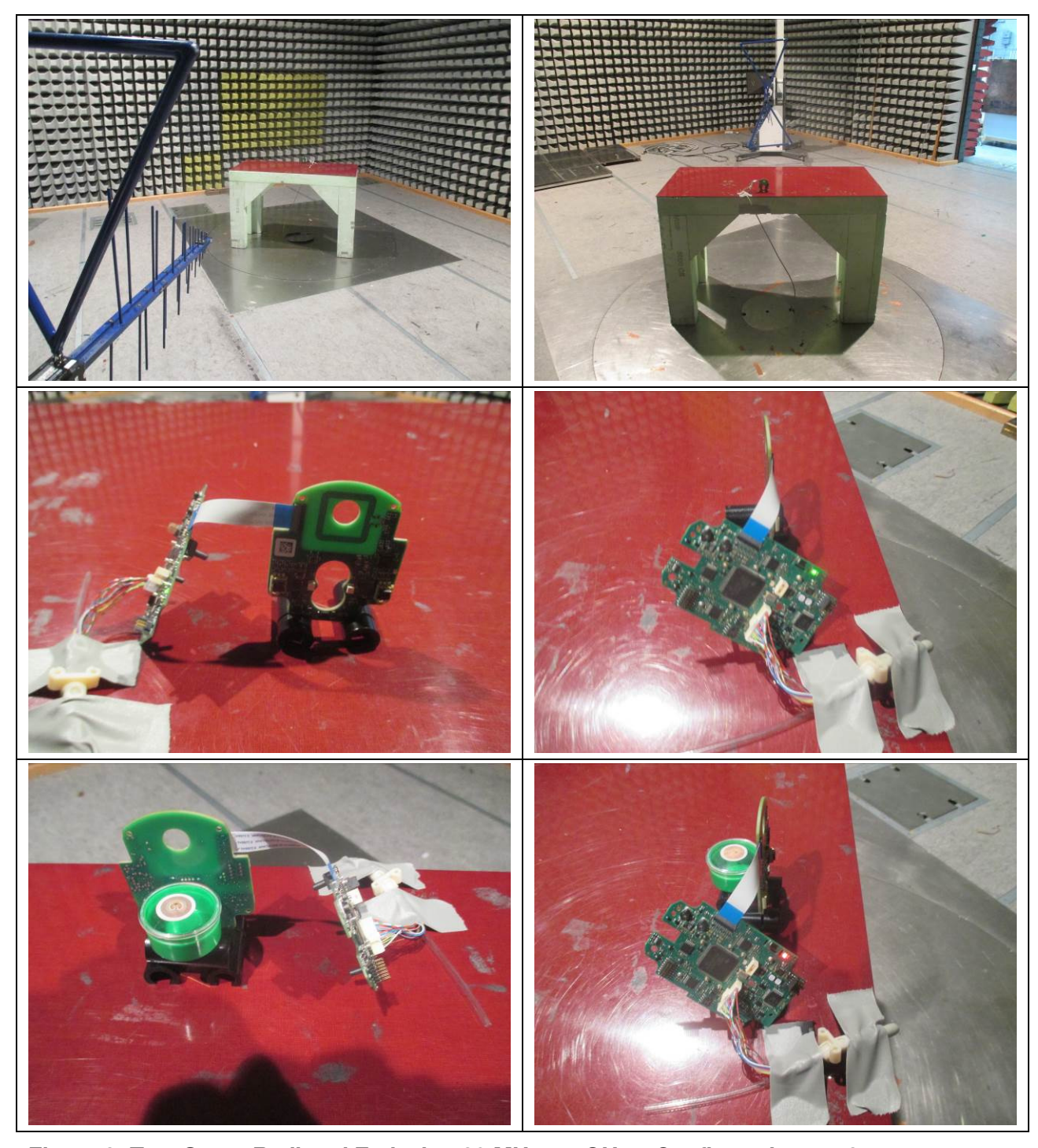
Figure 3: Test Setup Radiated Emission 30 MHz – 1 GHz – Configurations 1, 2