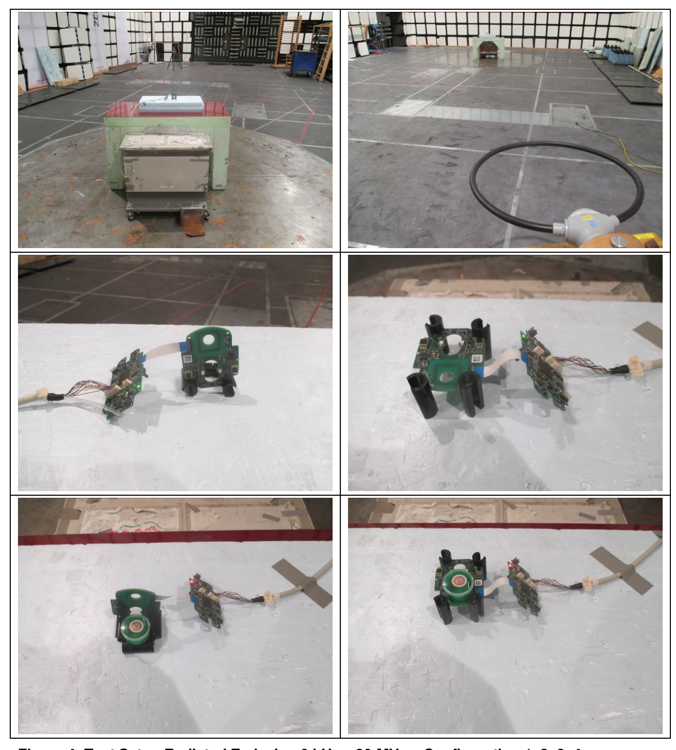
Figure 4: Test Setup Radiated Emission 9 kHz - 30 MHz - Configuration 1, 2, 3, 4