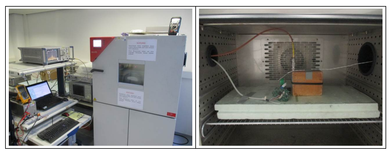
Figure 2: Test Setup Occupied Bandwidth – Configuration 2