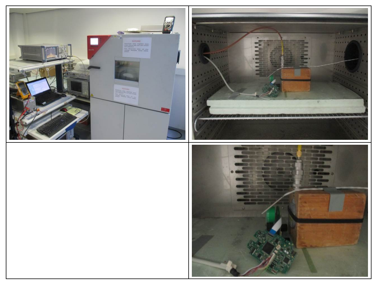
Figure 5: Test Setup – Frequency Stability with voltage or/and Temperature variation – Configuration 2