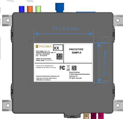
Figure 5. DSRC OBU Label Placement and Dimensions

There is a specific area on the Top Side of the DSRC OBU to allocate the Label as shown below.