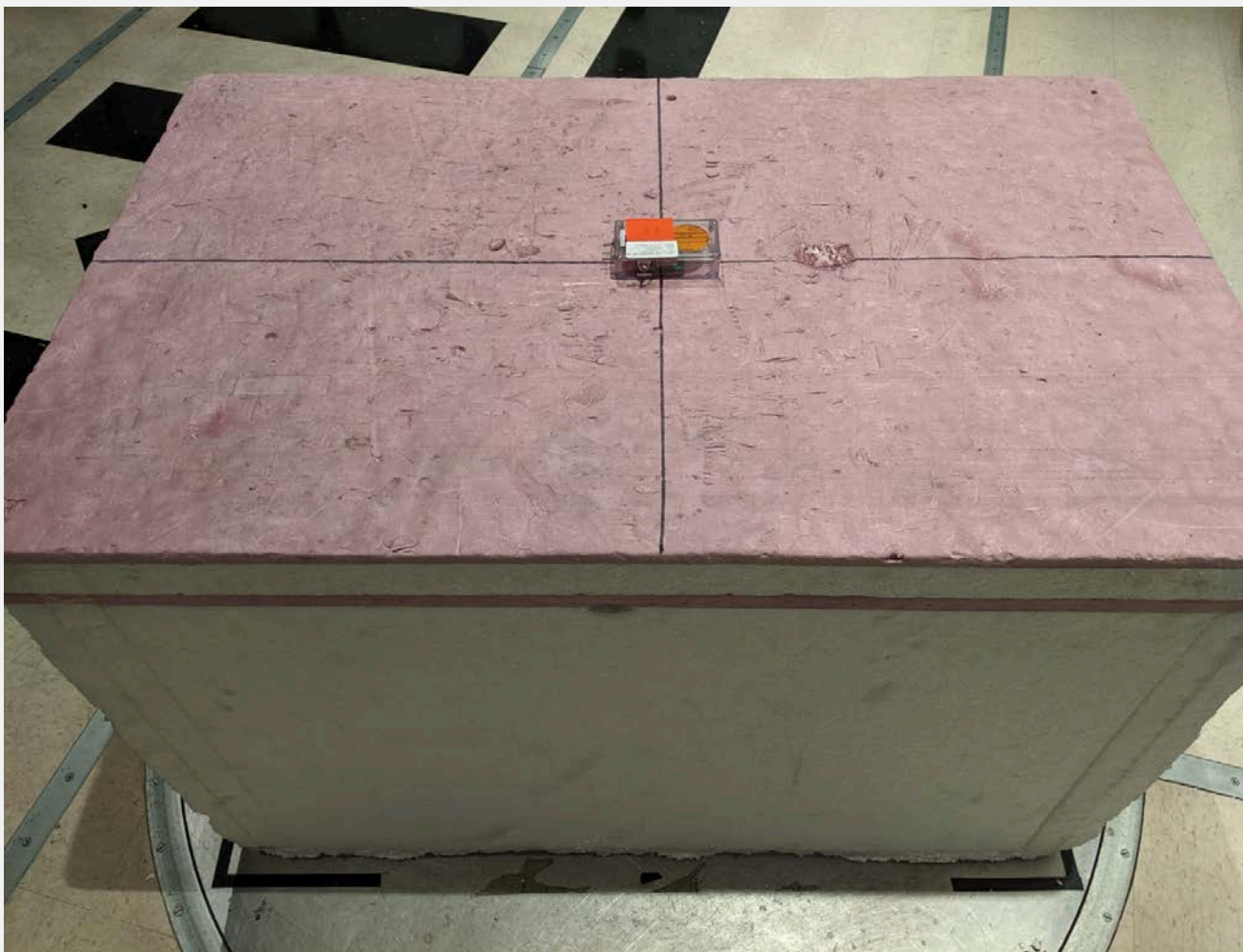
Radiated Emissions, Photo 1

Applicant: LOEN ENGINEERING INC. FCC ID: 2AVOA-SSM1