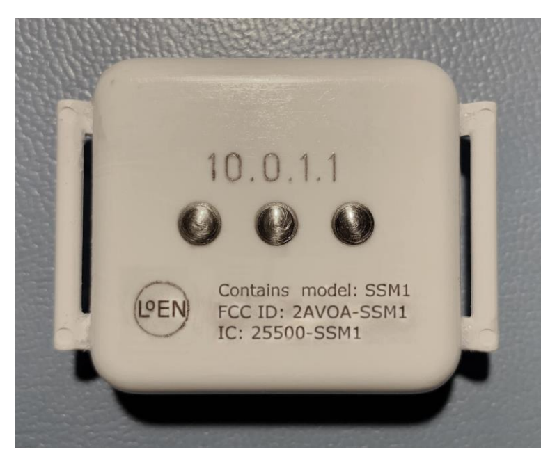
Bottom of Host Device

Subject: Label Location on Host Device for FCC ID: 2AVOA-SSM1 and IC: 25500-SSM1