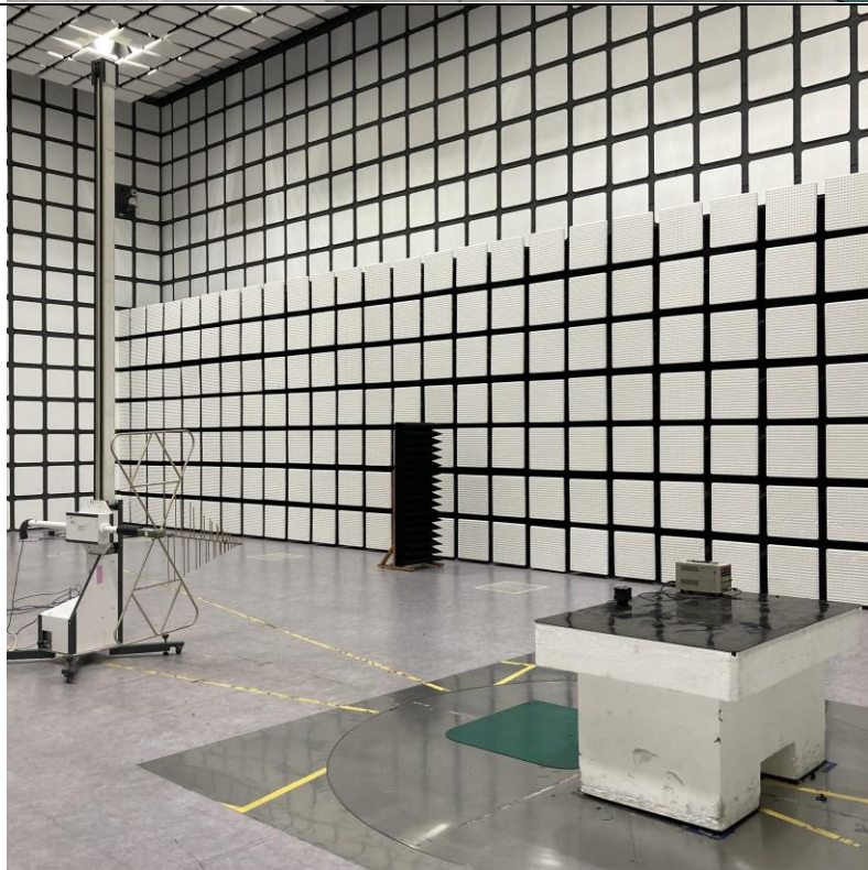
30 MHz ~ 1 000 MHz