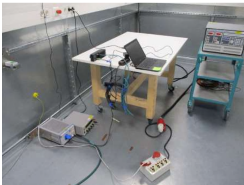
Figure 3 – Conducted emission