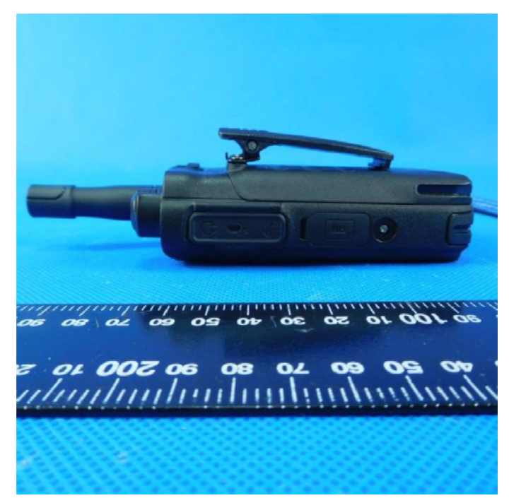
LEFT VIEW OF SAMPLE