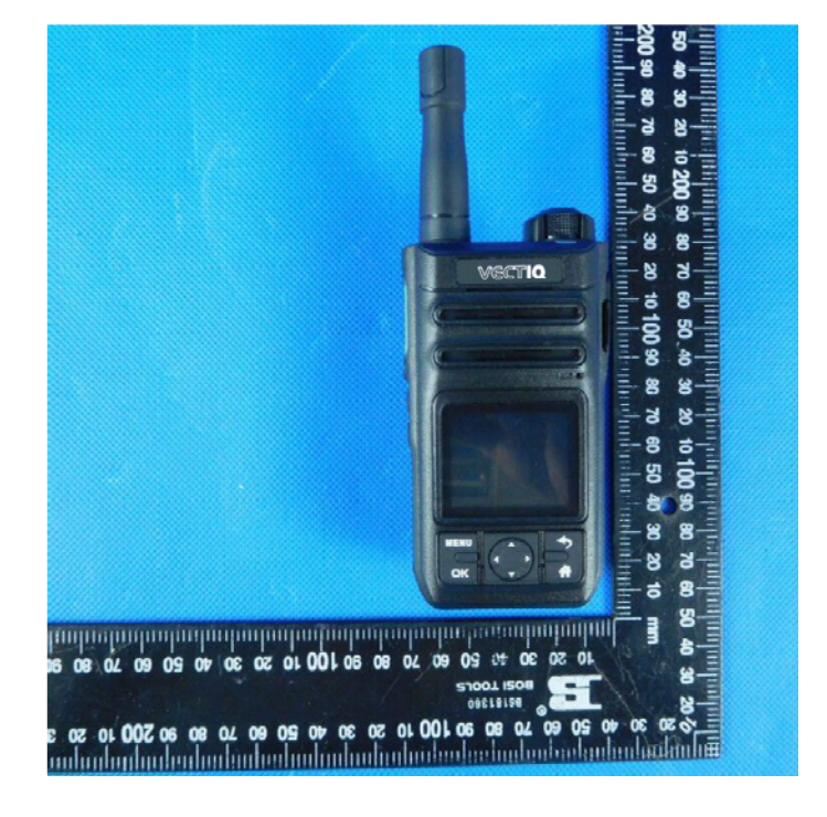
FRONT VIEW OF SAMPLE