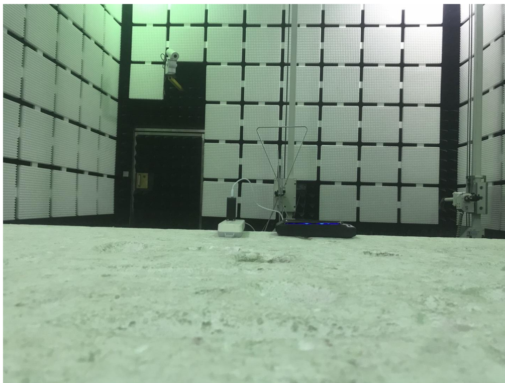
Radiated Emission Below 1 GHz