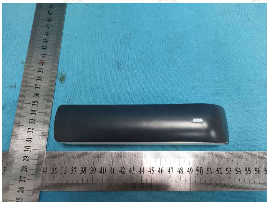
View of Product-3