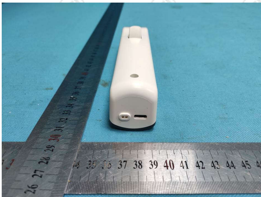
View of Product-7