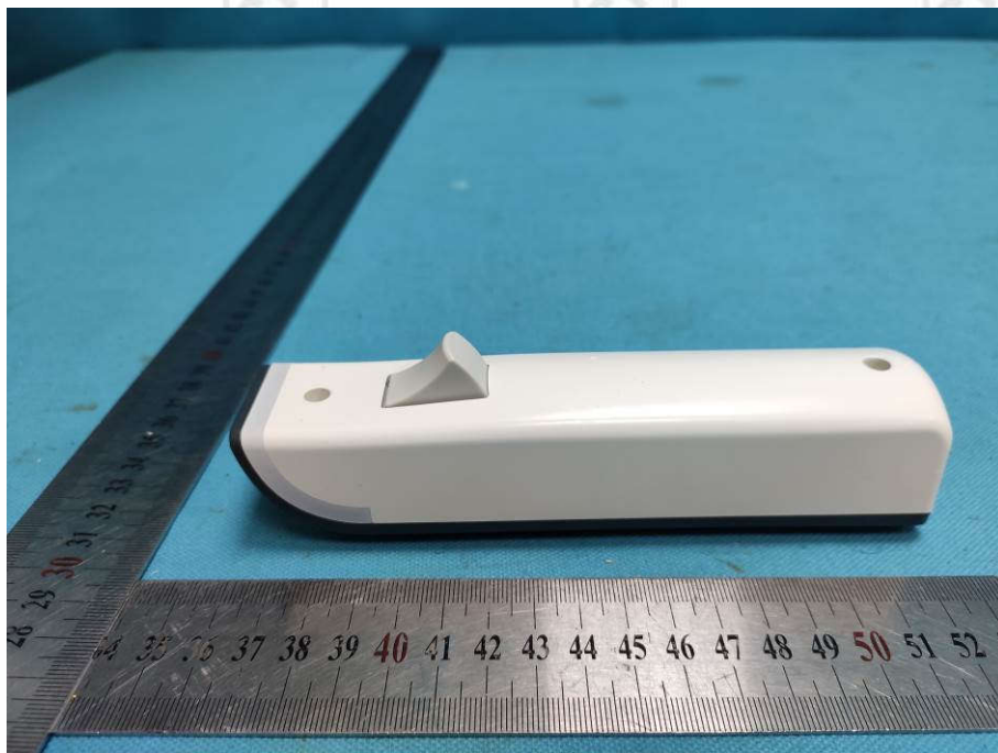
View of Product-6