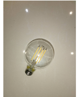
DSG25-AD8S E26 WIFITYCW DSG25-AD8S E26 WIFITYW

We confirm that all information above is true, and we'll be responsible for all the consequences.