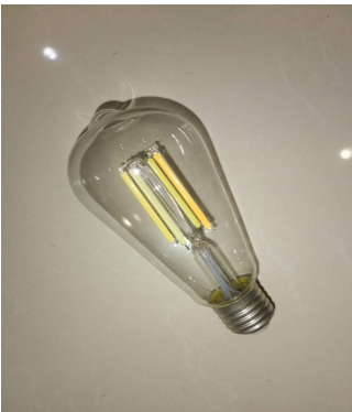
DSST21-AD8S E26 WIFITYCW BW223

The differences of them are as follows: Model name and appearance.