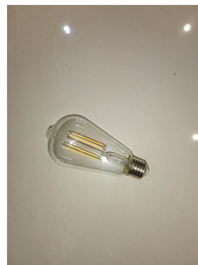
DSST19-AD8S E26 WIFITYCW DSST19-AD8S E26 WIFITYW