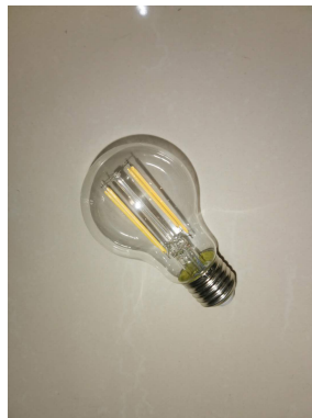
DSA19-AD8S E26 WIFITYCW DSA19-AD8S E26 WIFITYW