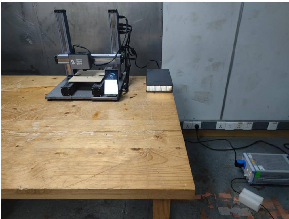
Photo of Conducted Emission Measurement