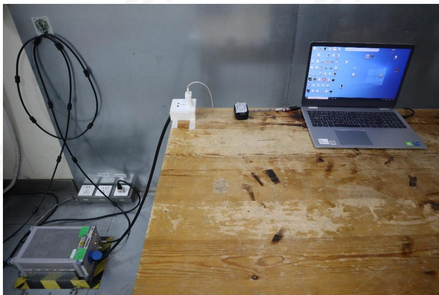
RE (Below 1GHz)