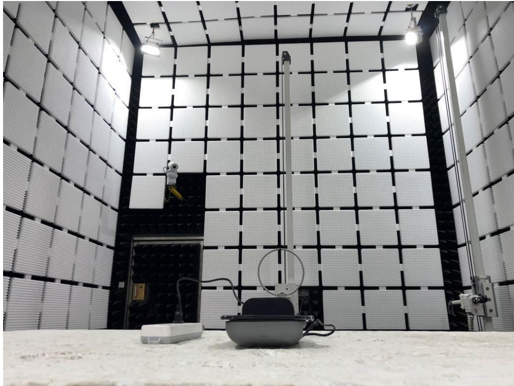
Radiated Emission below 30MHz