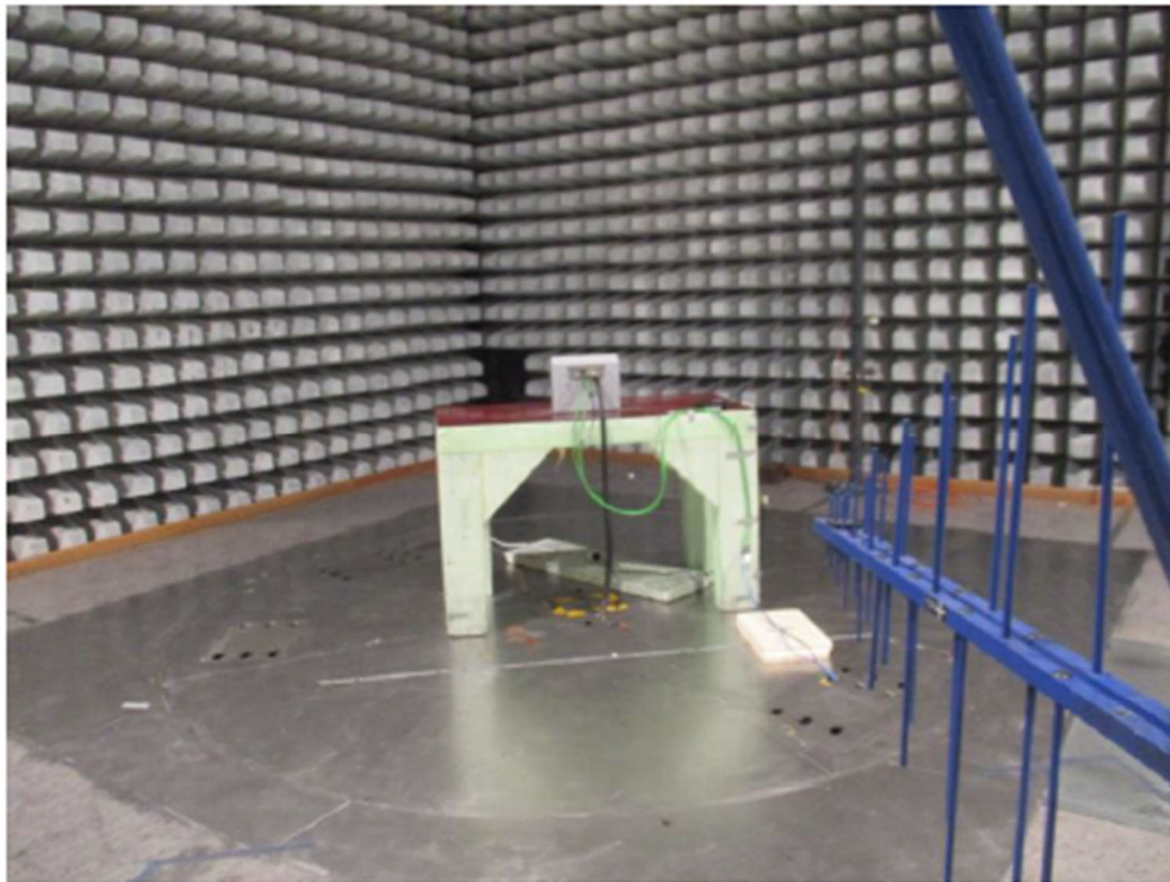
Figure 6-4: test setup for Radiated disturbances 30 MHz to 1000 MHz