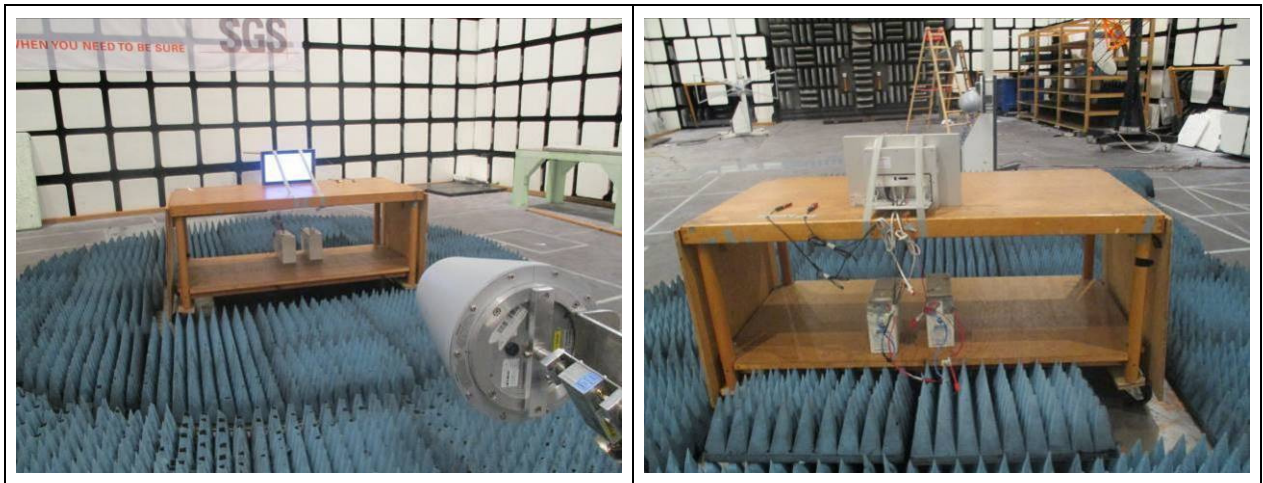
Figure 1: test setup for Radiated disturbances 1 GHz to 6 GHz