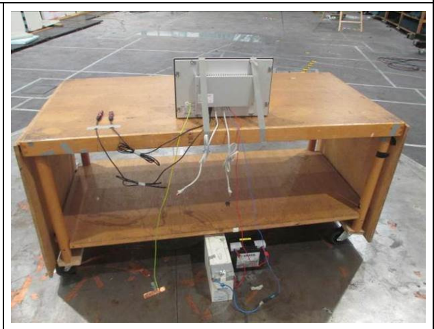
Figure 2: test setup Radiated disturbances 30 MHz to 1000 MHz