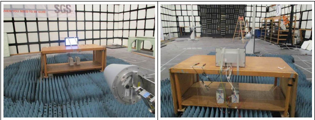
Figure 1: test setup for Radiated disturbances 1 GHz to 6 GHz