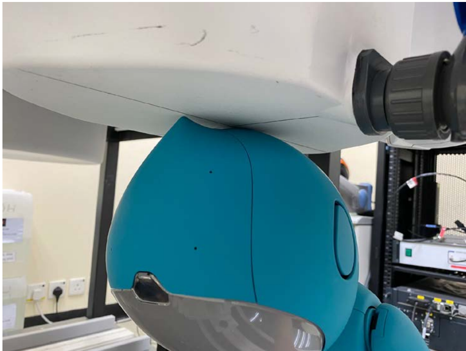
Figure 2 – Rear Top