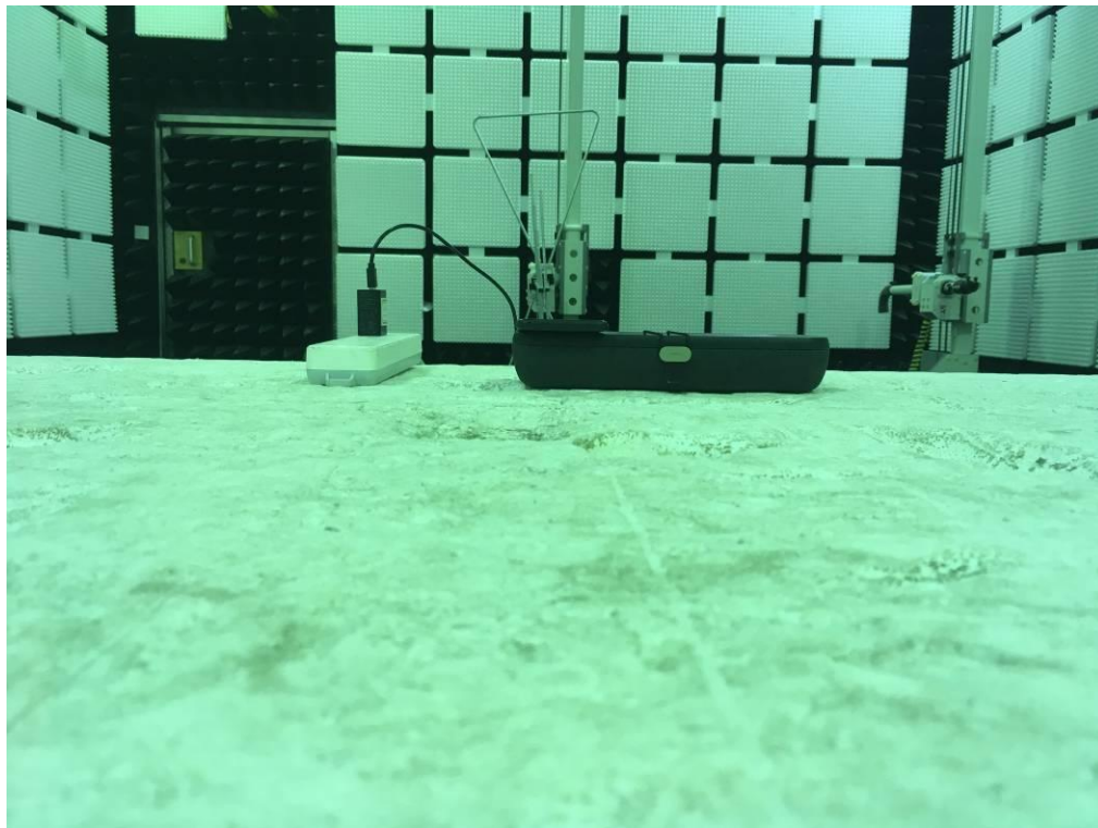
Radiated Emission Below 1 GHz