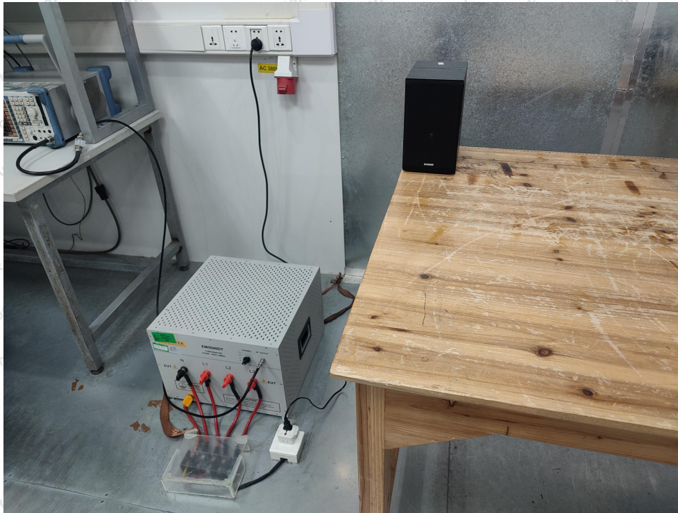
Photo of Radiation Emission Test