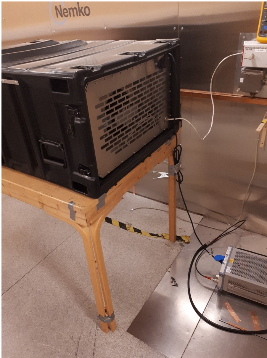
Test setup for conducted emissions measurement