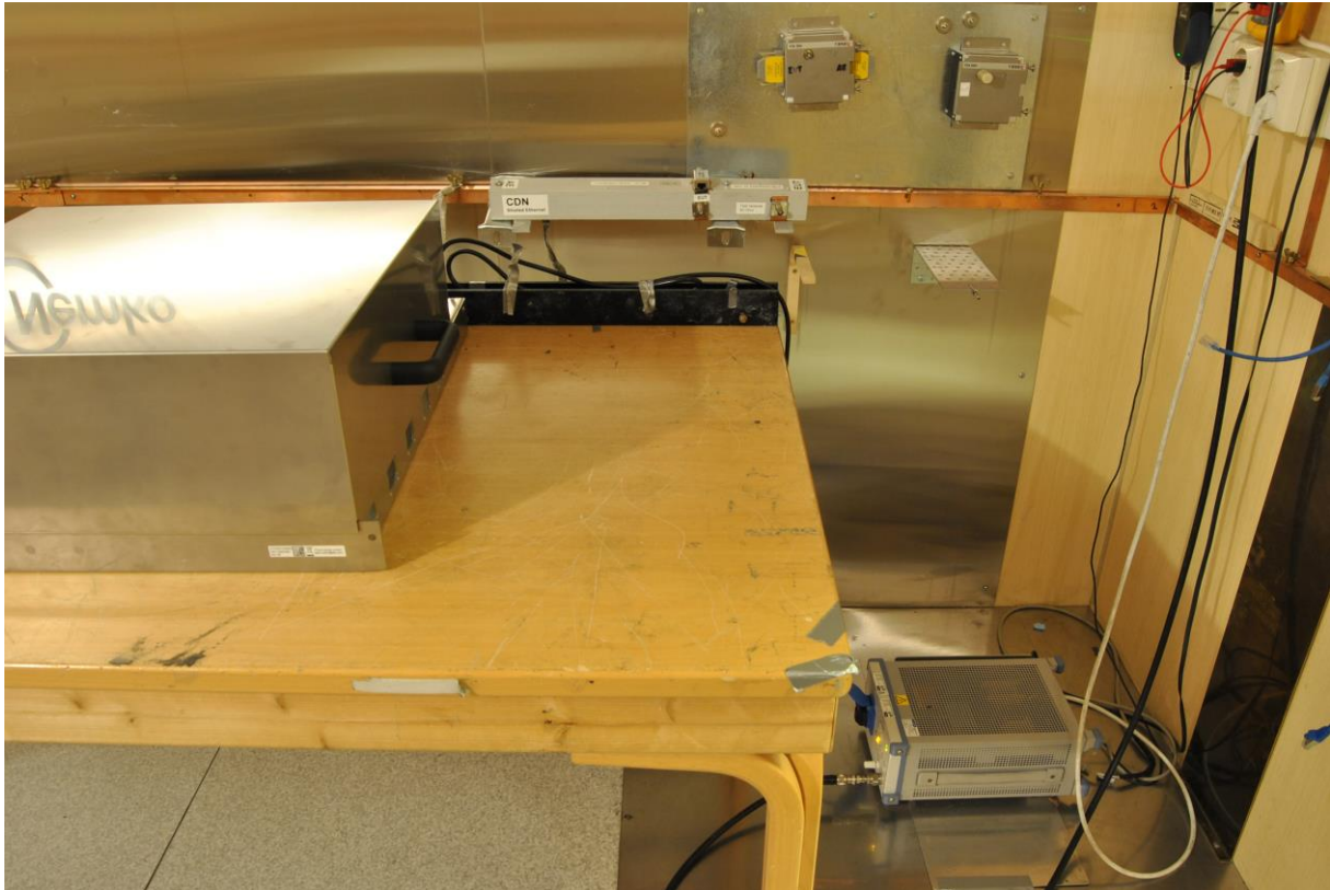
Power line Conducted Emissions Test