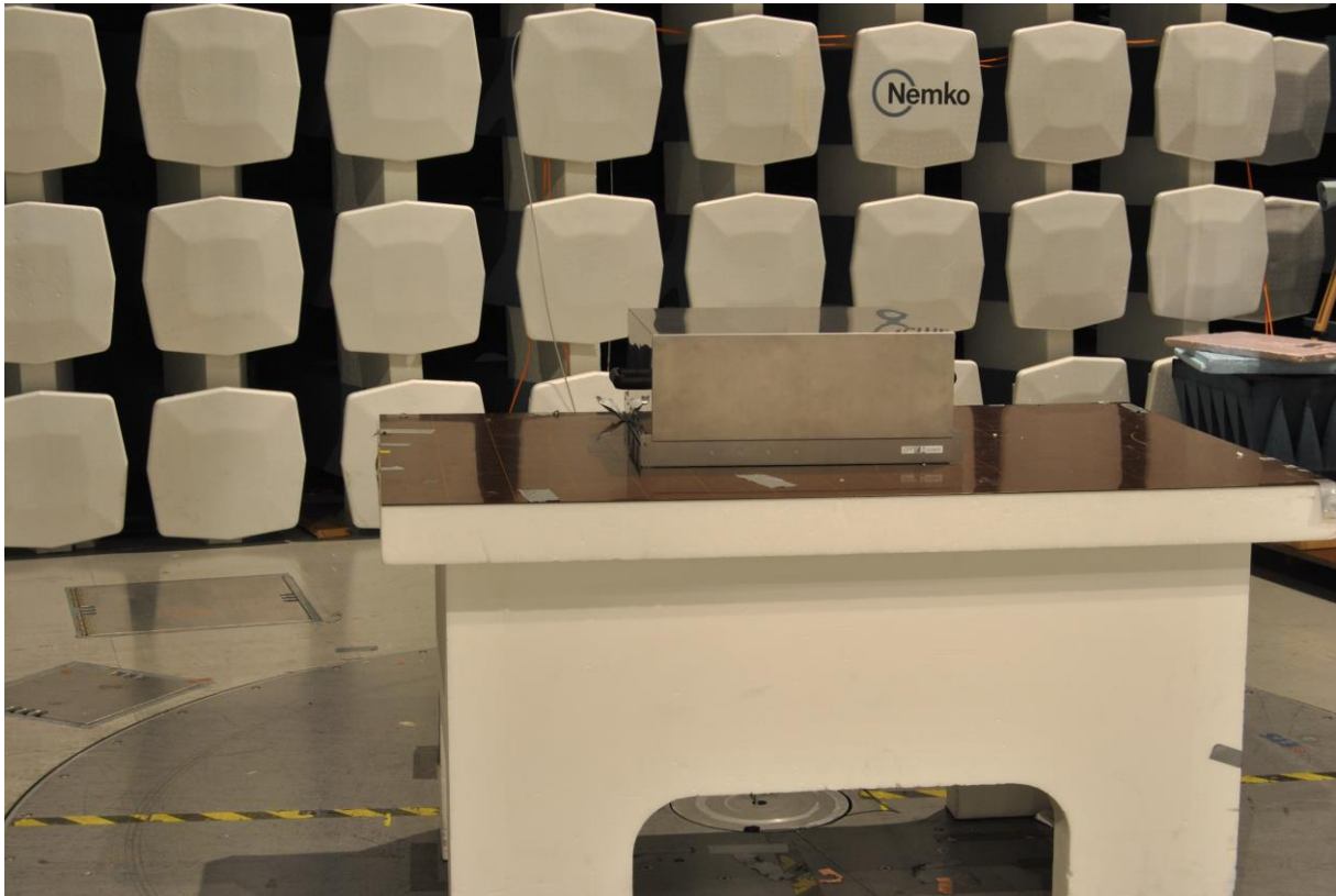
Radiated Emissions 9 kHz – 1000 MHz