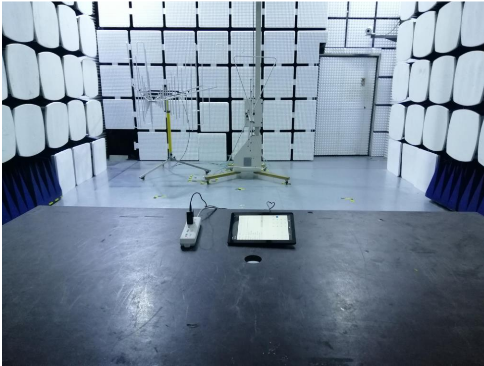
Fig. 1 (Below 1GHz)