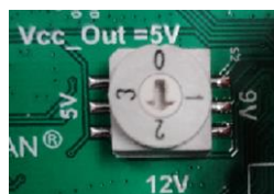
Figure 4. Vcc_Out Switch.