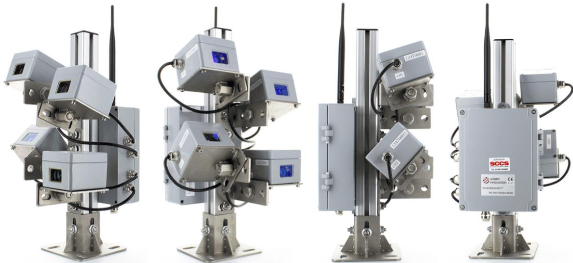
Figure 1. 4-Channel RS485 Interface Node Overview (with external Laser Distance Sensor, as example).

Our product has IP66 and is designed to work in a tough environment. It is small in size, reliable in performance, easy for maintenance, has high precision during sampling, and has strong immunity to radio-interference.