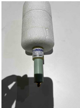
Fig 2 model 3126-5500 frequency 5500 MHz