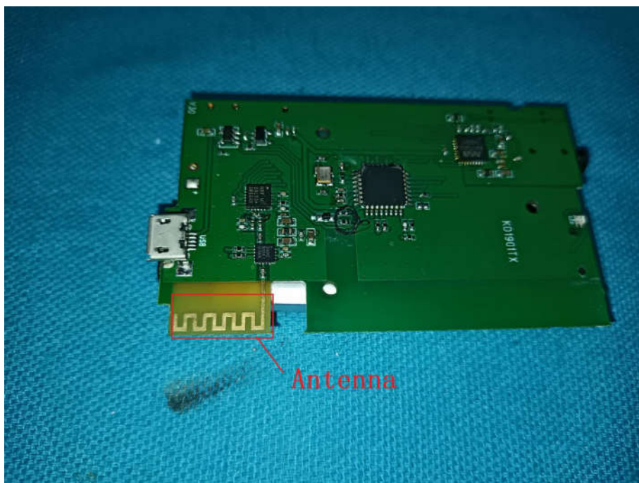
View of Product-11