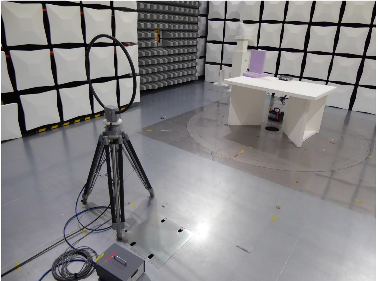
Test setup semi anechoic chamber (9 kHz – 30 MHz)