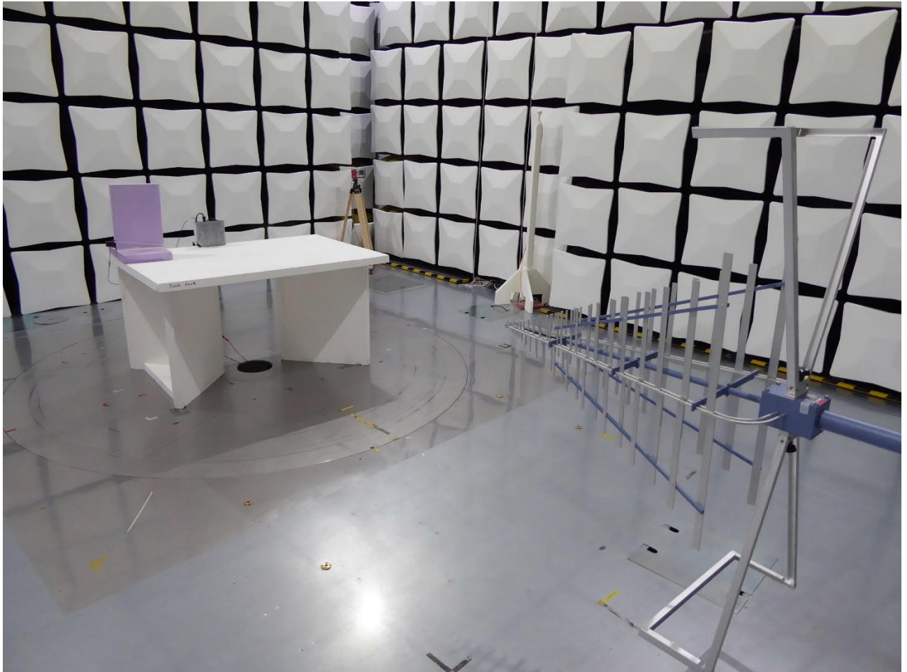
Test setup semi anechoic chamber (30 MHz – 1 GHz)