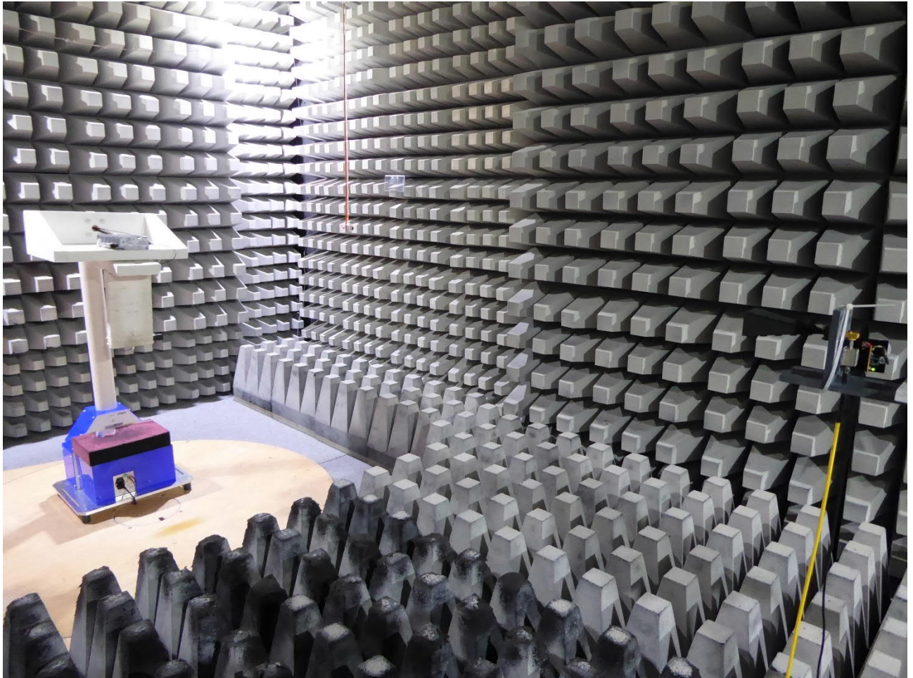
Test setup fully anechoic chamber (18 – 26.5 GHz)