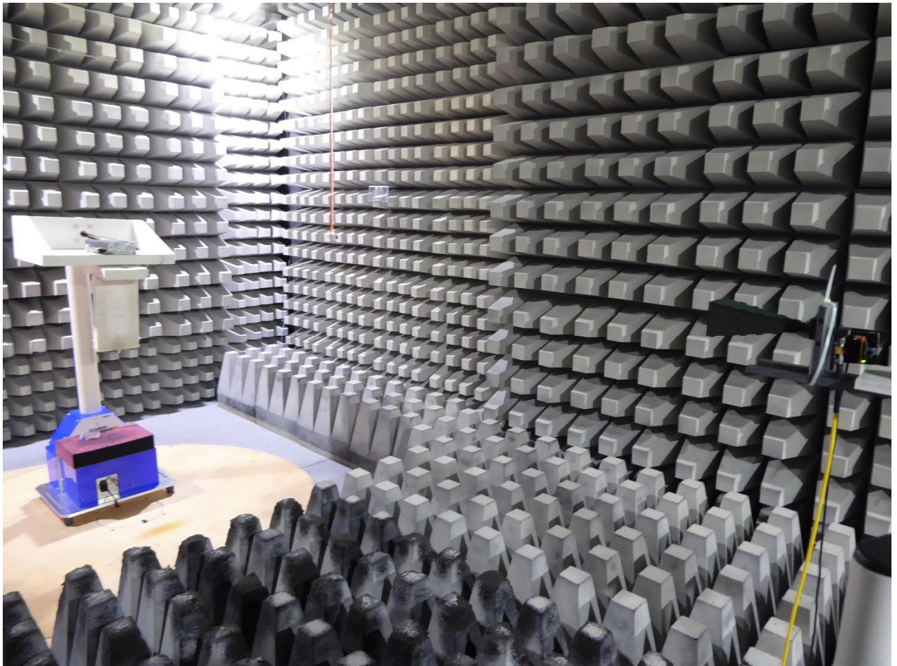
Test setup fully anechoic chamber (12 - 18 GHz)