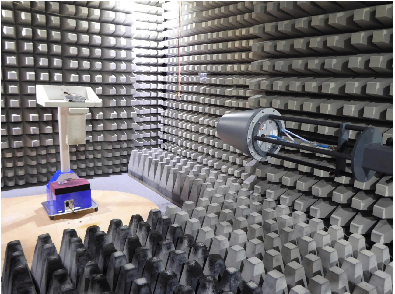
Test setup fully anechoic chamber (1 – 12 GHz)