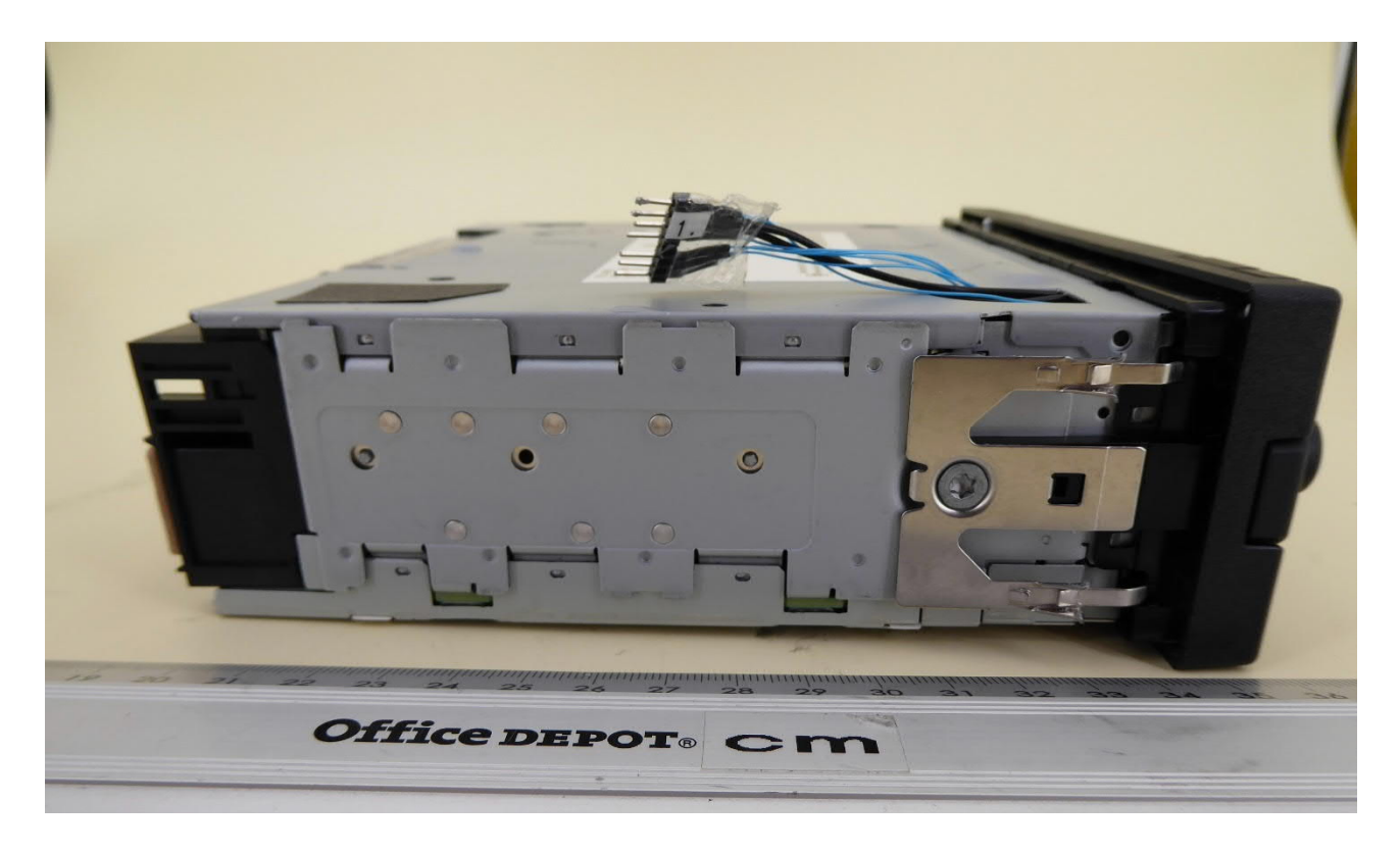
EUT – side view 2*

* Photograph was taken of an EUT, which was modified for the radio tests