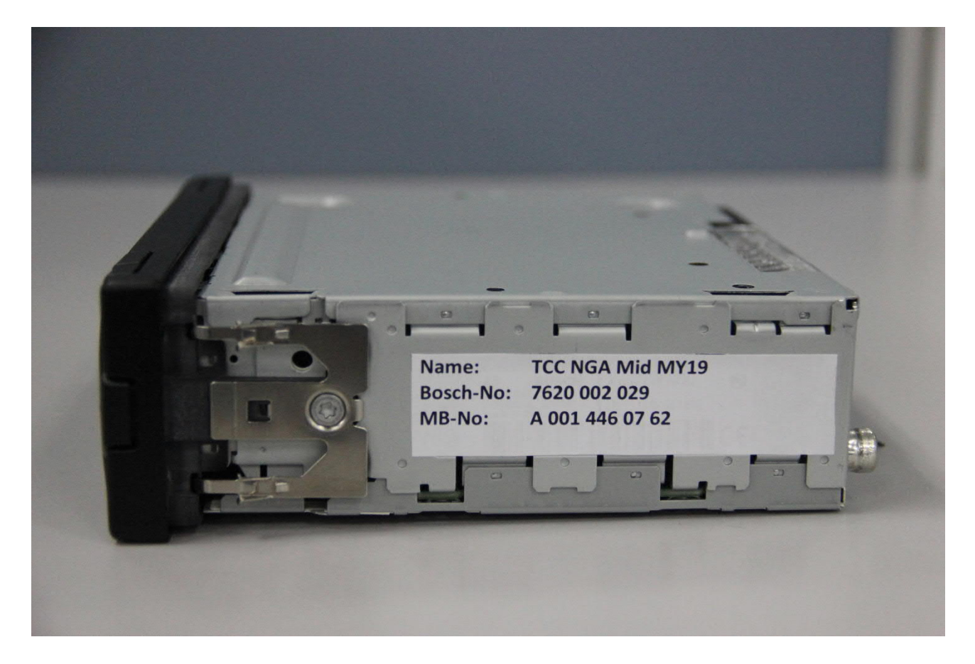
EUT – side view 1*

* Photograph was provided by the applicant