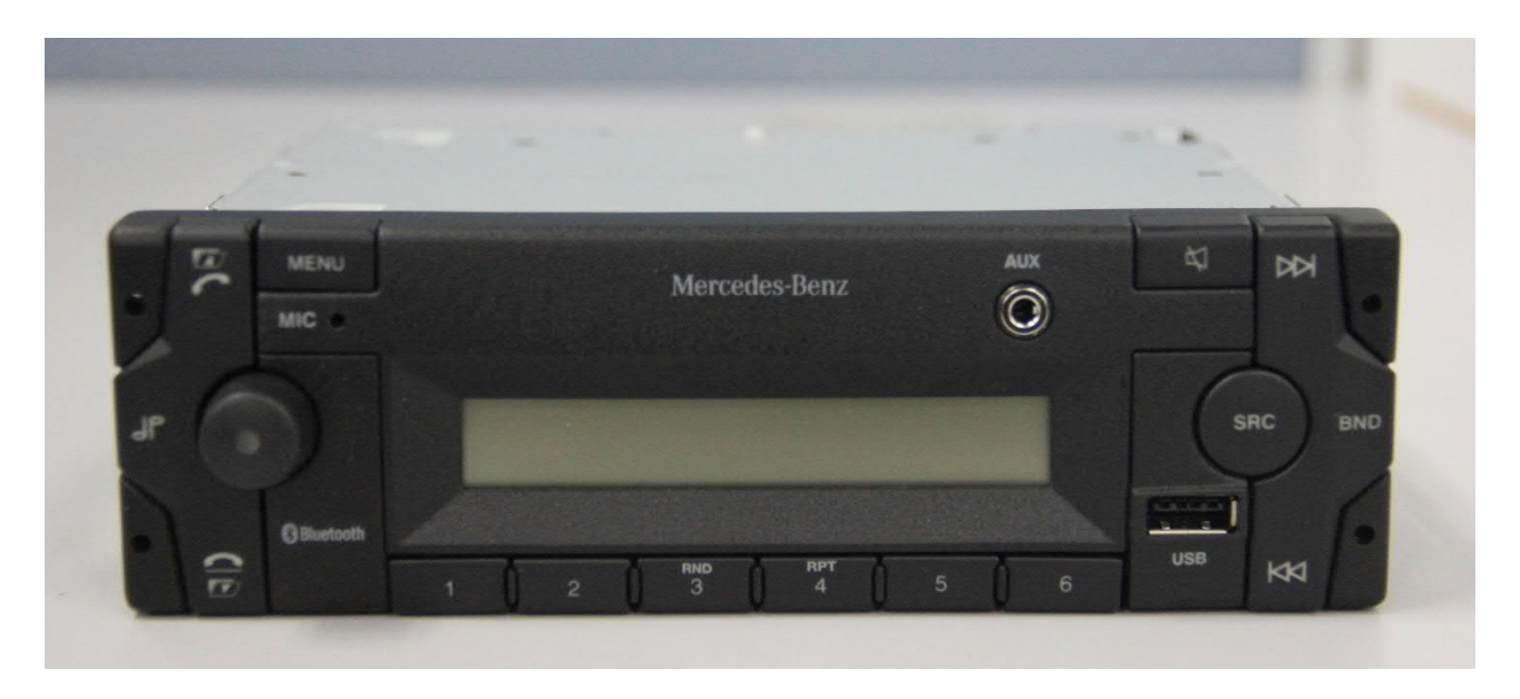
EUT - Front view*

* Photograph was provided by the applicant