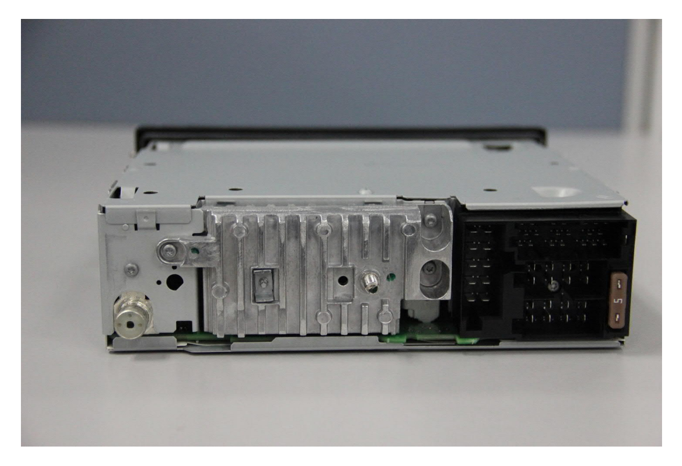
EUT - back view*

* Photograph was provided by the applicant