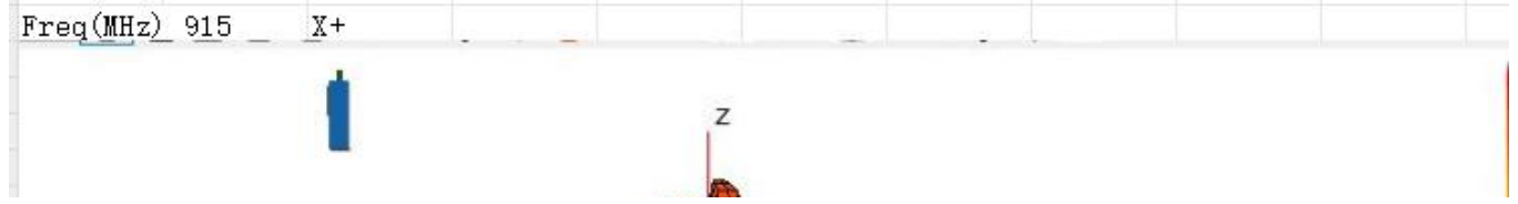
Realized Gain Plot 1