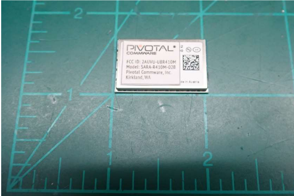
Top Side of Module