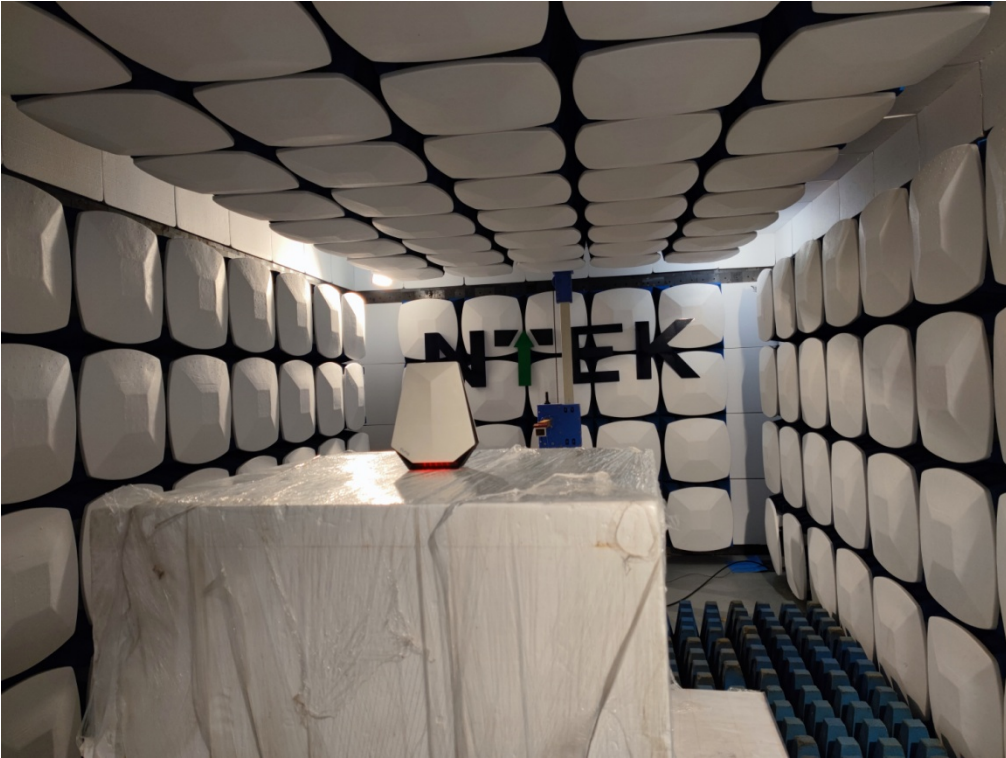
AC Conducted Measurement Photos