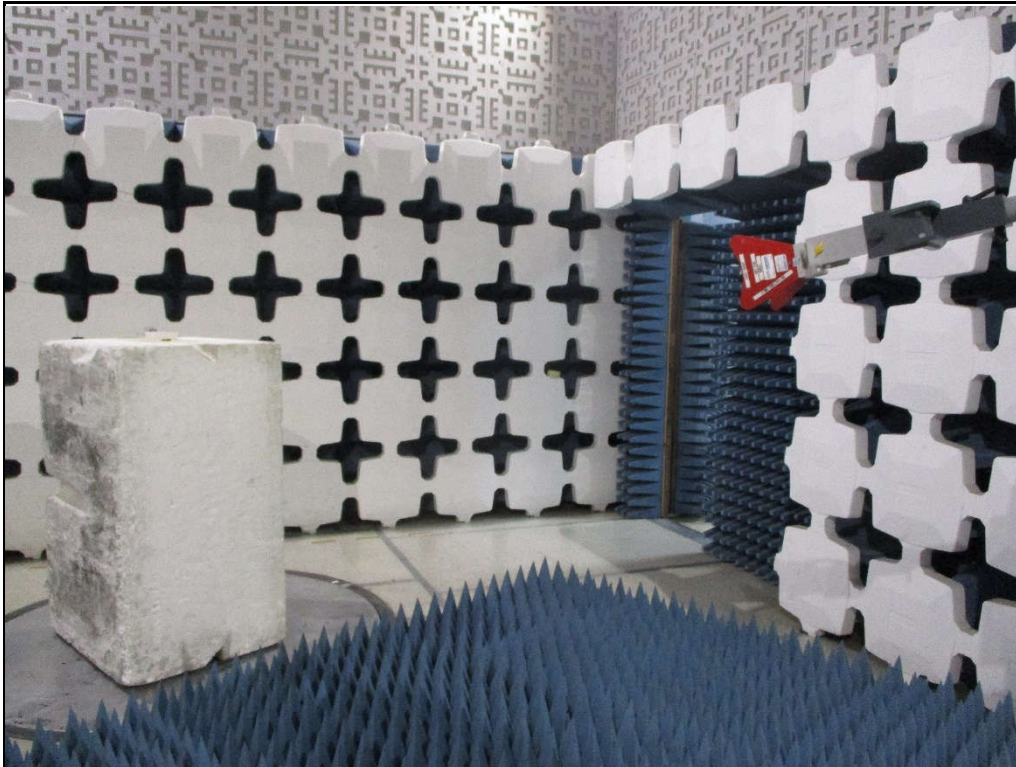
Test Setup for Spurious Radiated Emissions, 1 – 10GHz – Antenna Polarization Horizontal