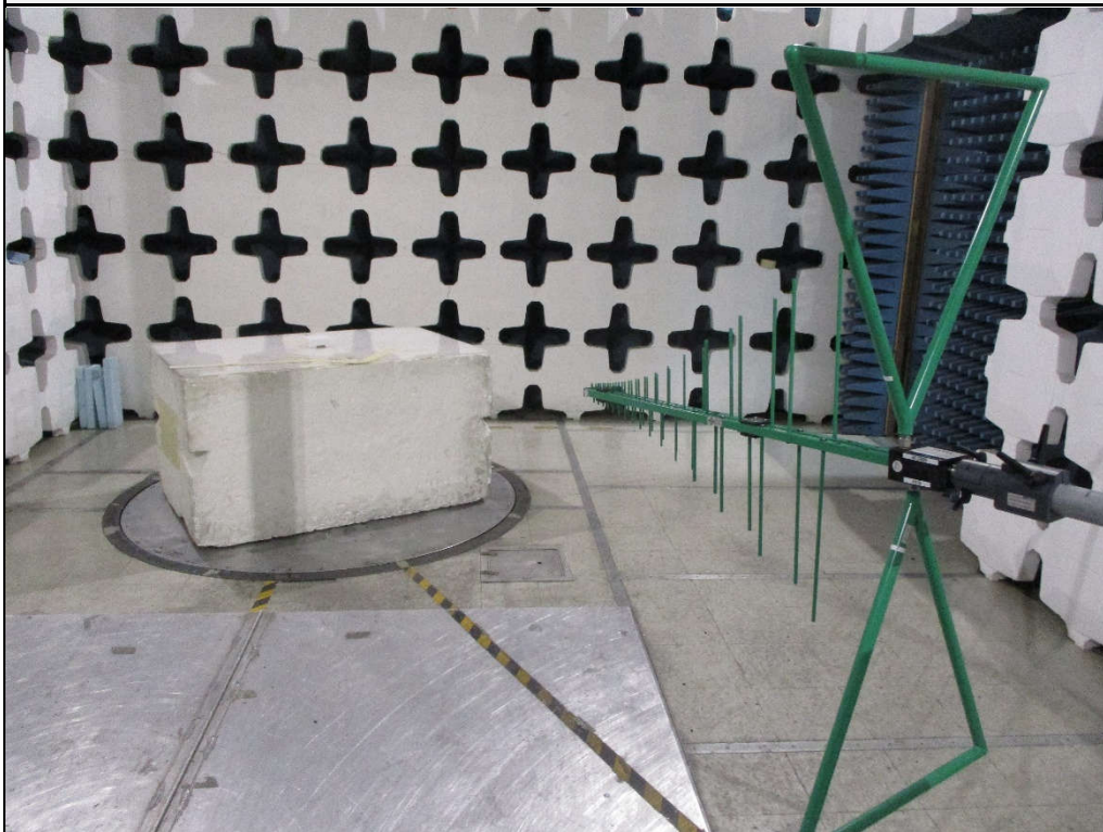
Test Setup for Spurious Radiated Emissions, 30MHz – 1GHz – Antenna Polarization Vertical