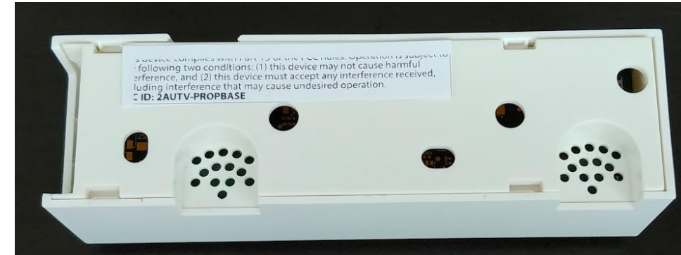
Product housing top and Bottom with FCC label location shown