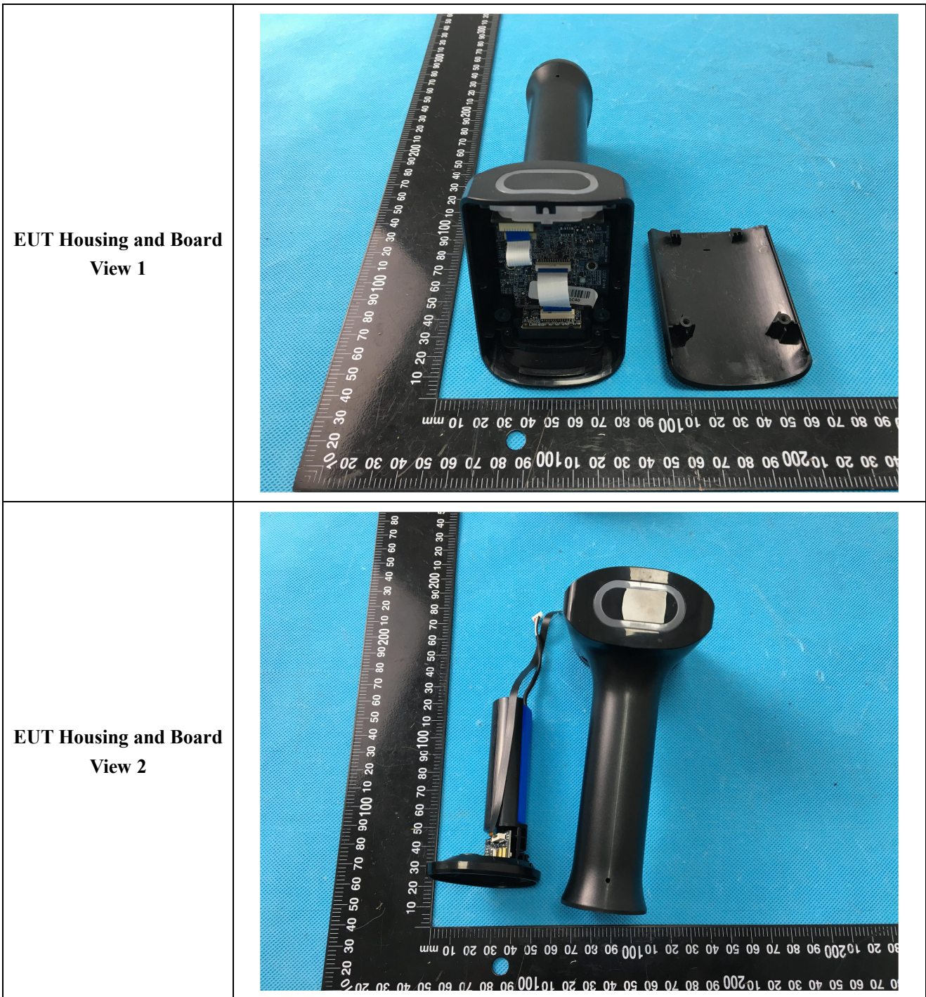
EXHIBIT 3 - EUT INTERNAL PHOTOGRAPHS