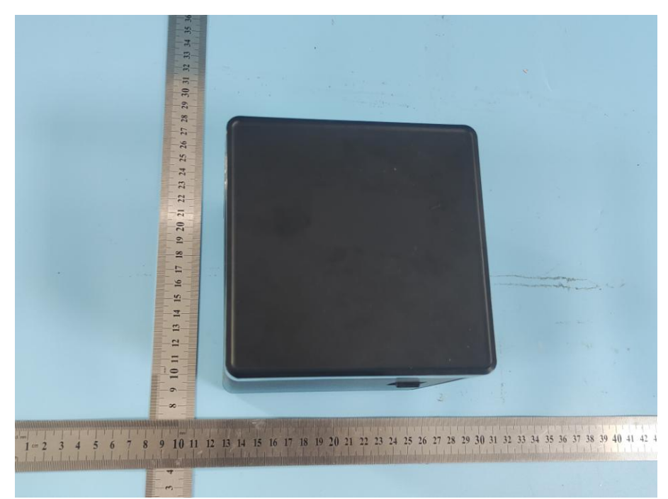
TOP VIEW OF SAMPLE