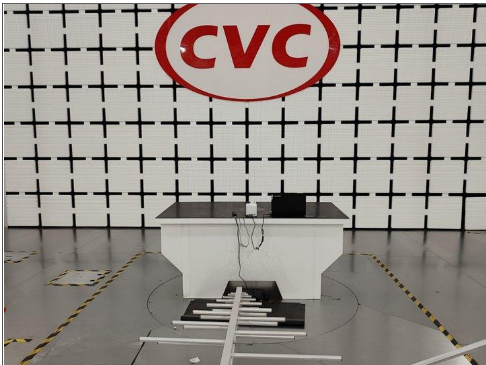
RADIATED EMISSION TEST (30MHz~1GHz)