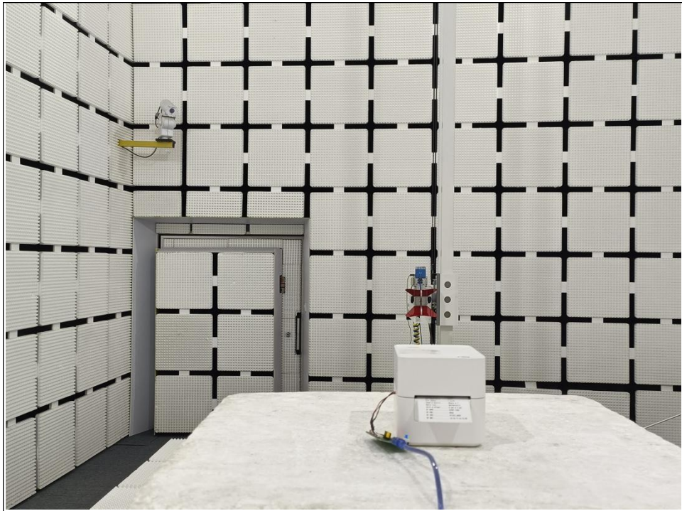
RADIATED EMISSION TEST (1GHz ~ 18GHz)