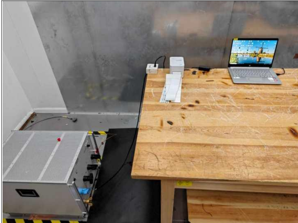
CONDUCTED EMISSION TEST