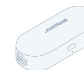
fully charged (green)